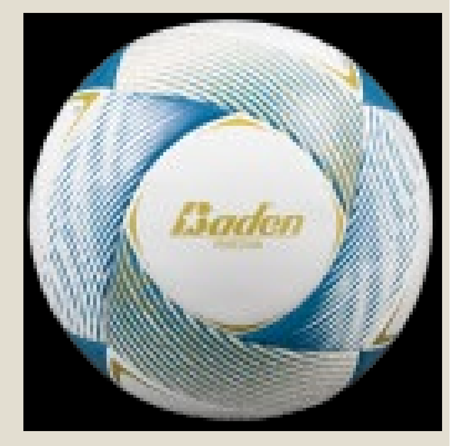
PERFECTION THERMO SOCCER BALL ST7